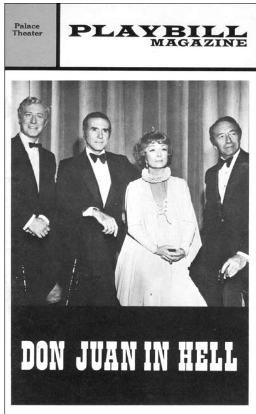
Edward Mulhare, Ricardo Montalban, Agnes Moorehead, and Paul Henreid in the 1973 Broadway production of Don Juan in Hell .

Shaw imagines Juan, the girl, and the statue—plus the Devil, of course—reunited in hell. Ana, the girl, most newly arrived, is shocked to find that hell is not the storied place of pain and punishment but is, rather, a place for the contemplation of aesthetic and sensual beauty and populated by all the best society. Ana's father, who is so fond of the fine statue of him his daughter commissioned that he's taken its form, was originally sent to heaven, but finds himself so bored there that he is giving it up to move to hell. Don Juan, however, is bored with hell and wants to move to heaven, where, he imagines, he will be able to contribute to the evolutionary process (what he calls the Life Force) that will enable the human race to progress past the sensual to its utopian destiny. The Devil argues for the advantages of hell and is pessimistic that the human race is capable of any kind of progress. The result is the most entertaining dramatic debate on heaven and hell, social custom and nonconformity, and the battle of the sexes ever written.